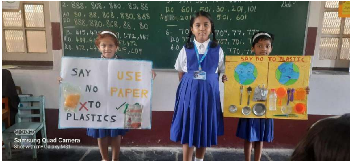
Say no to plastic..