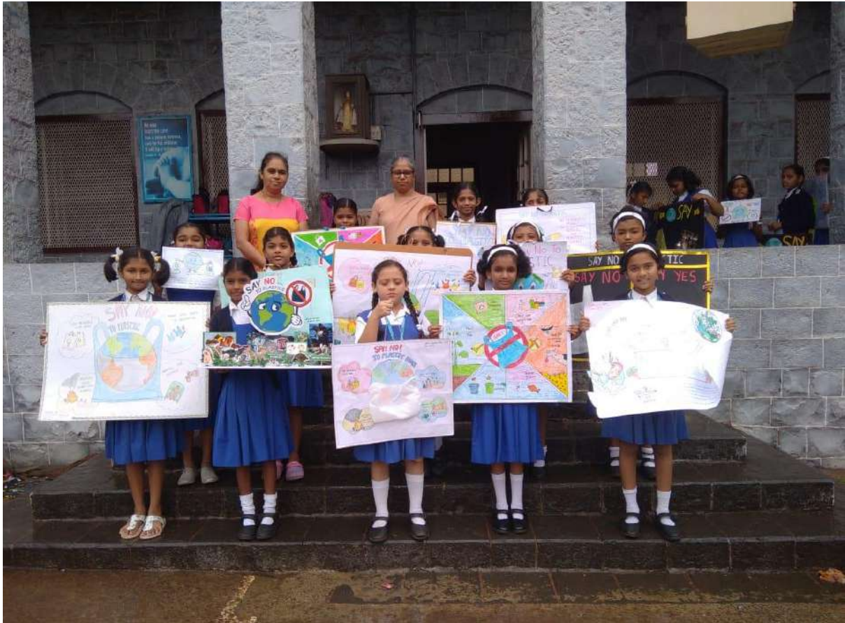
plastic Free Environment