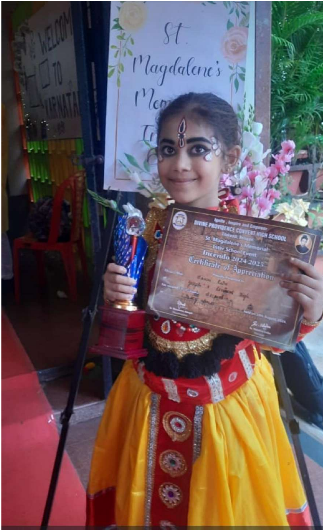
2 nd place in Fancy Dress competition