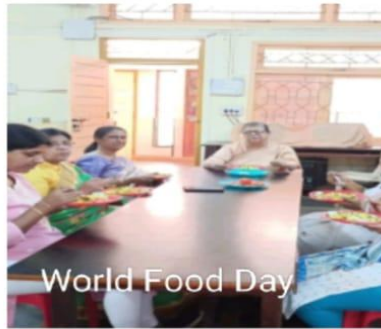
World Food Day