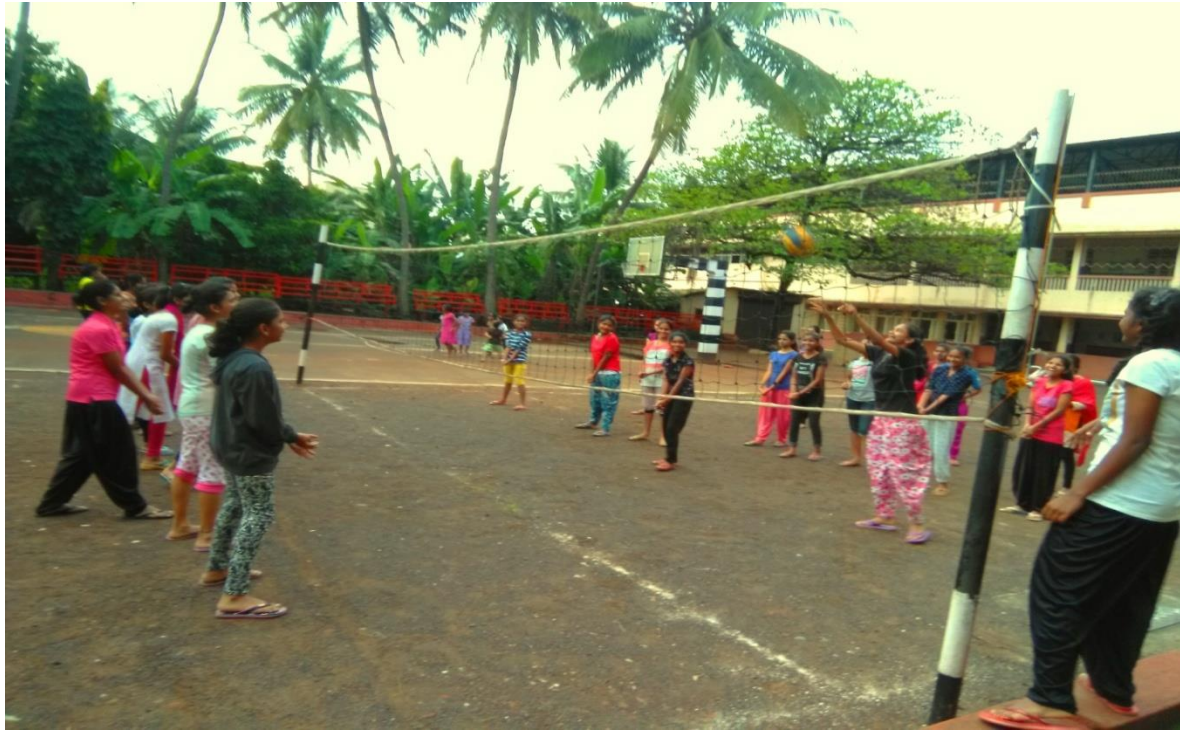
PLAYING THROW BALL AND ENJOYING THE EVE TOGETHER