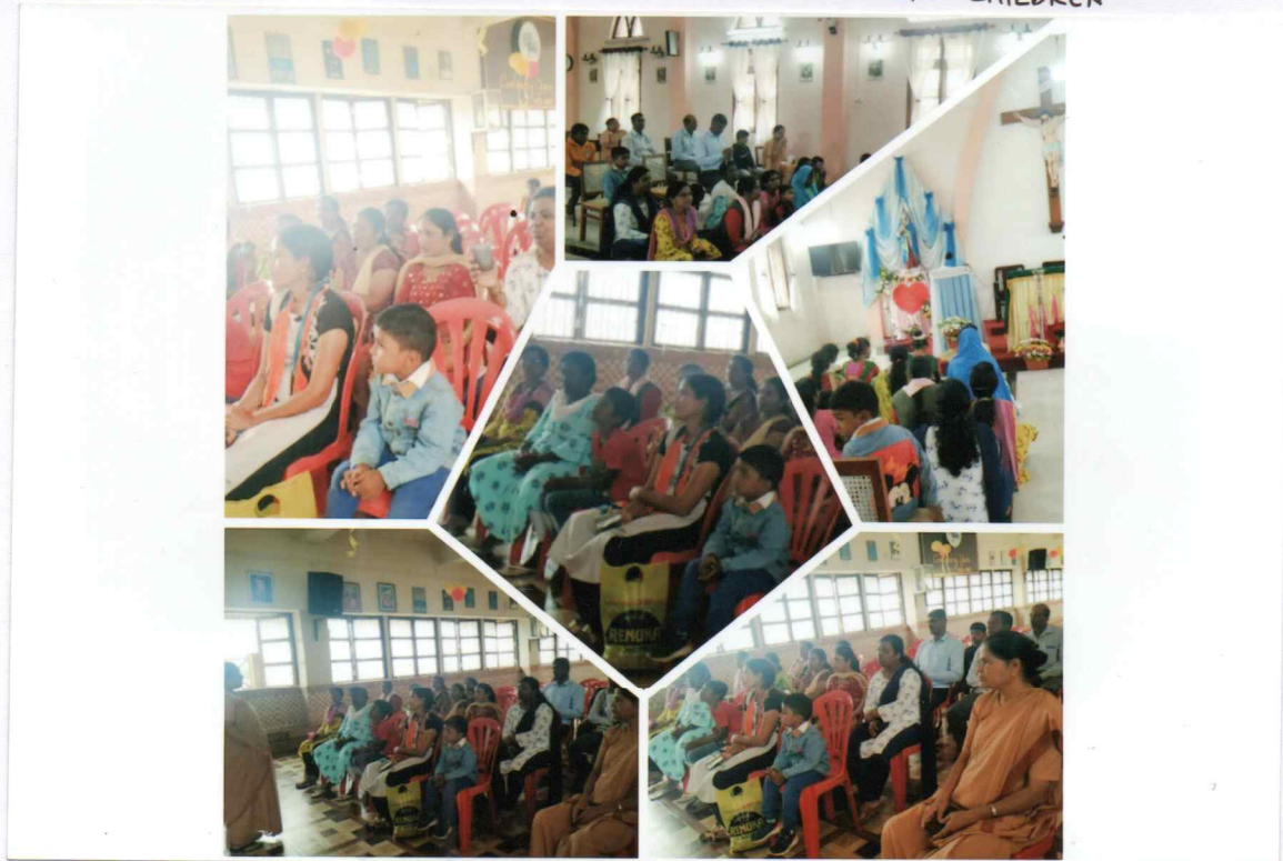
YEARLY GET TOGETHER OF PARENT'S AND CHILDREN