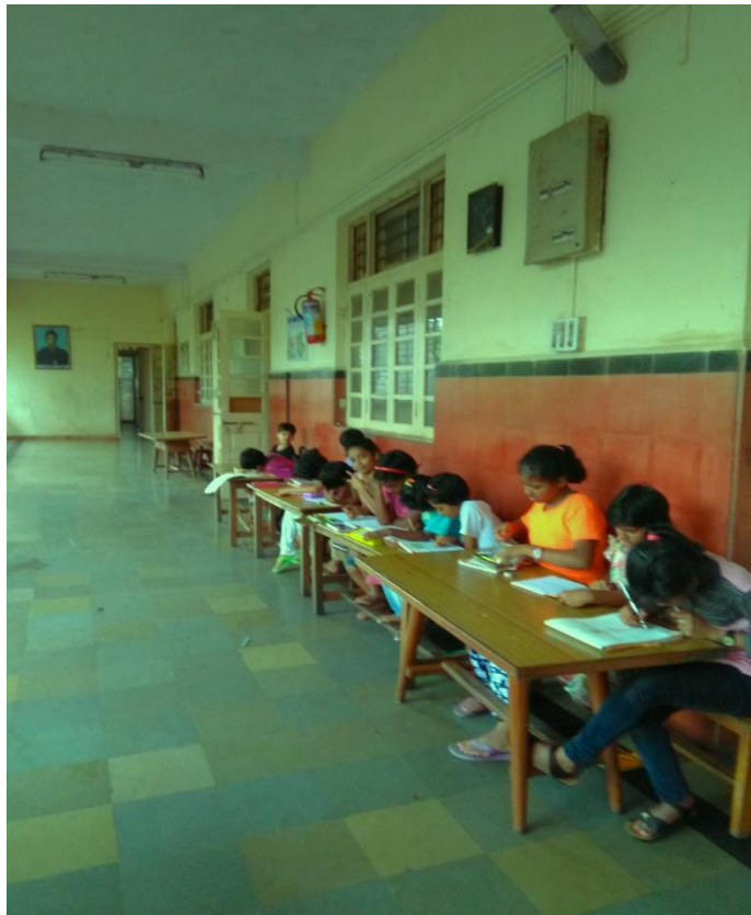
CREATING ART AND HELPING EACH OTHER