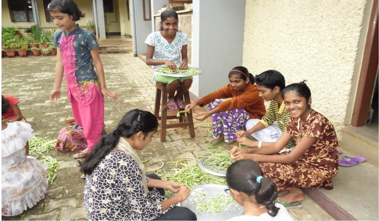
CHILDREN HELP IN THE KITCHEN ON SUNDAYS