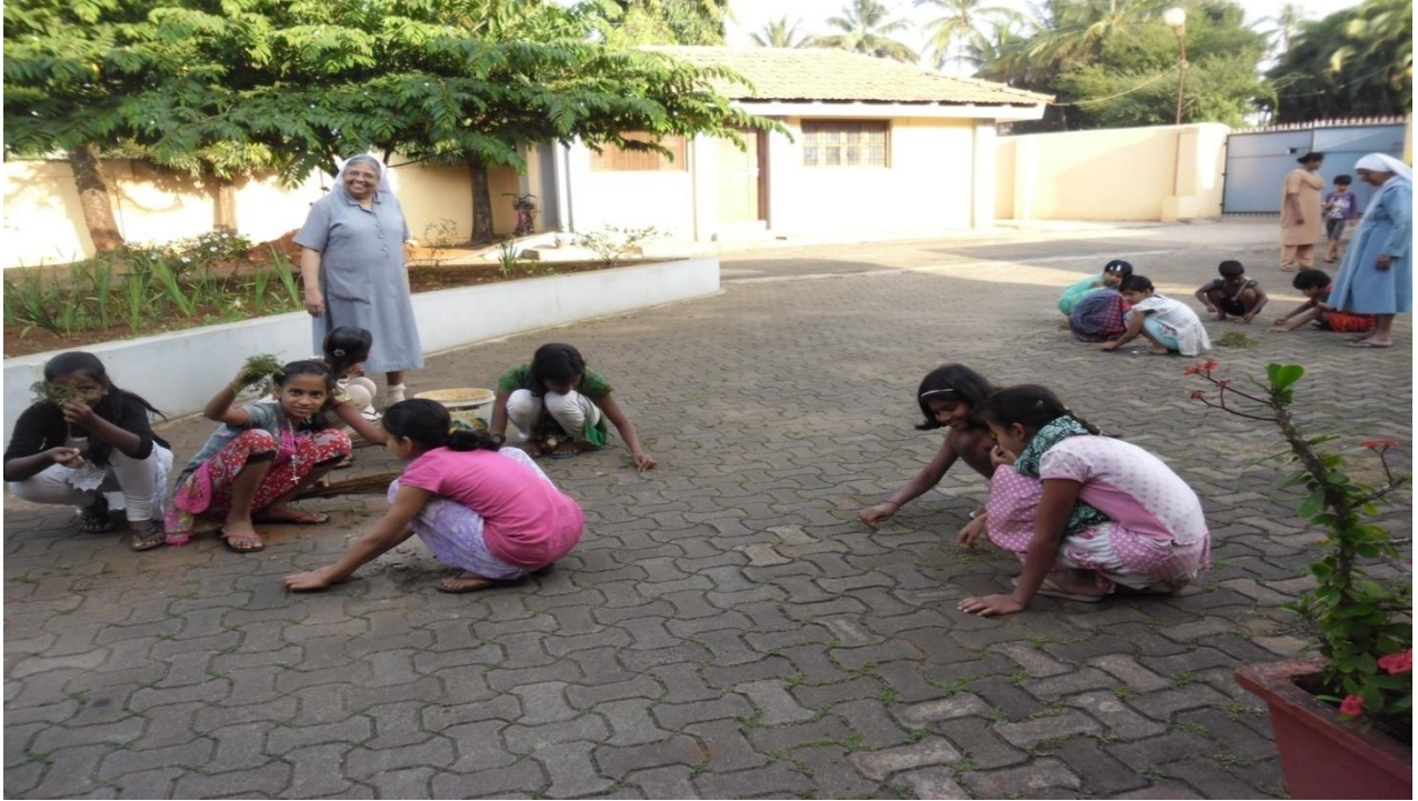
TEACHING THE CHILDREN HOW TO WORK AND PRAY TOGETHER