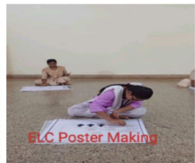
ELC Poster Making