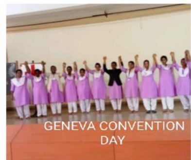
GENEVA CONVENTION DAY