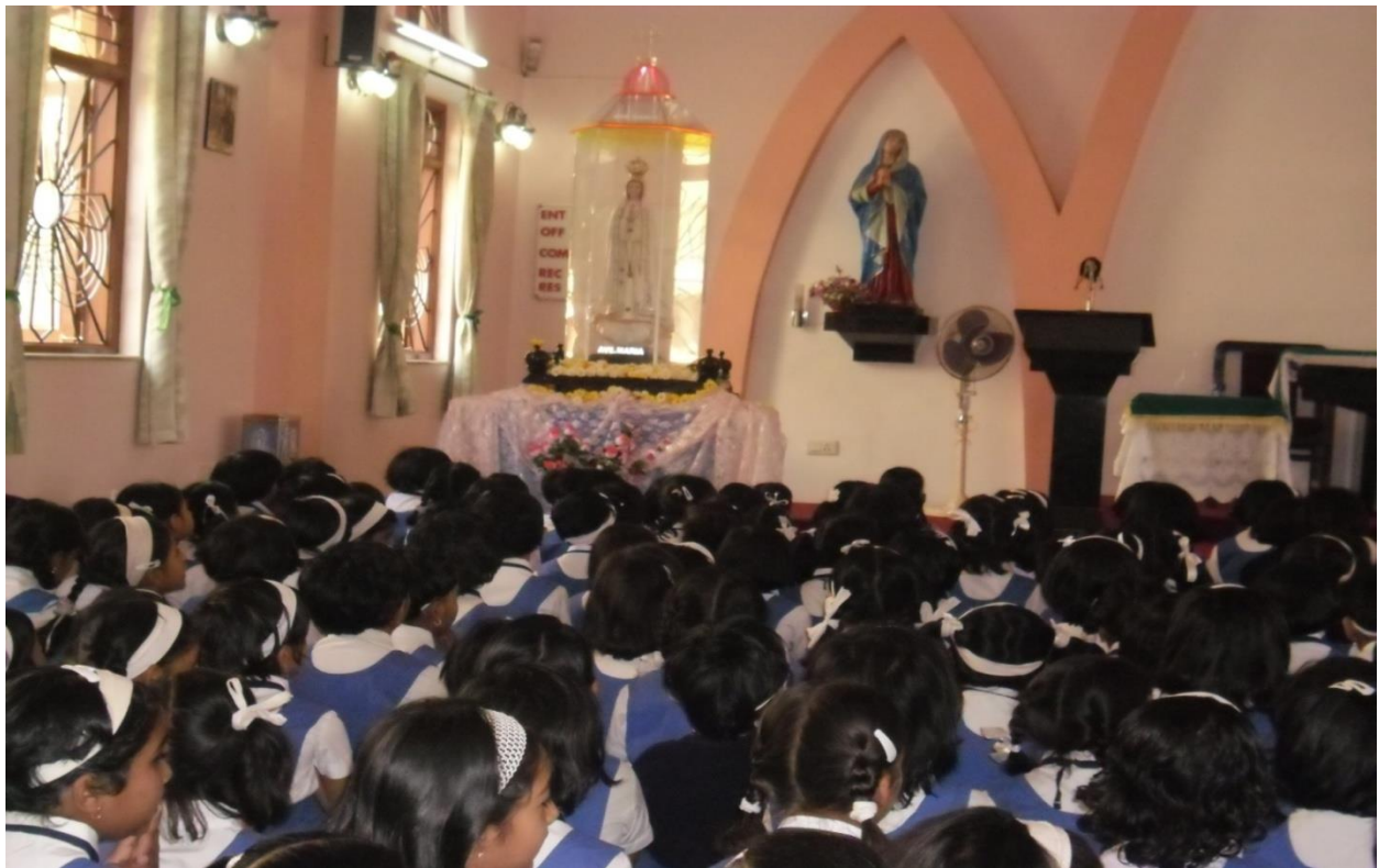
ORIENTATION PROGRAMME ALONG WITH OTHER SCHOOL CHILDREN