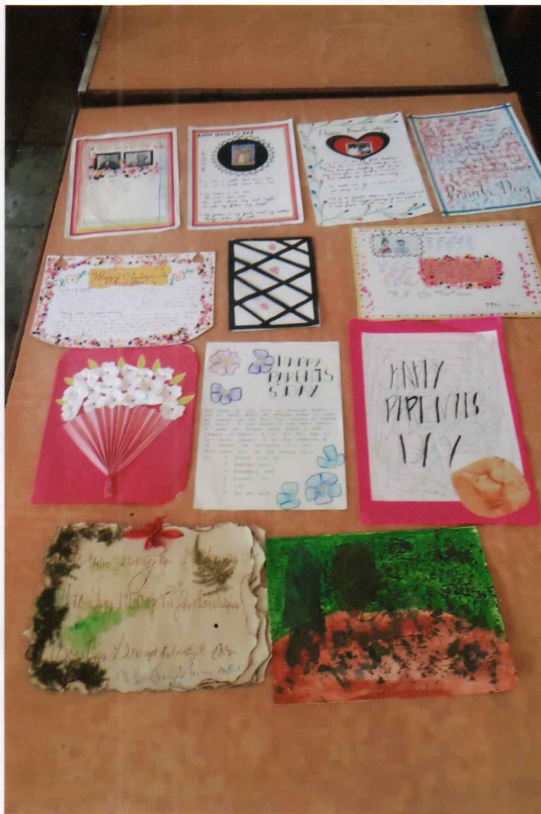
CARD MAKING COMPETITION ON PARENT'S DAY