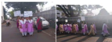
Voters' Awareness Rally