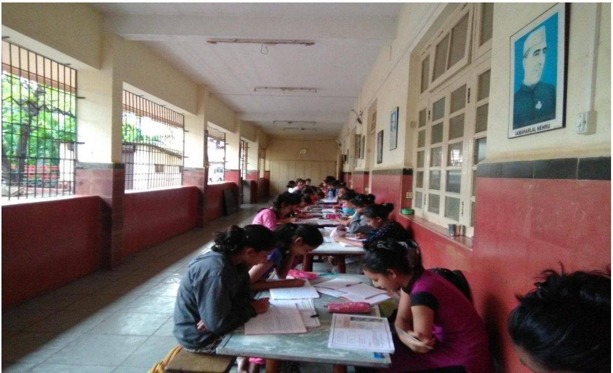
STUDENTS AT THEIR STUDY TIME