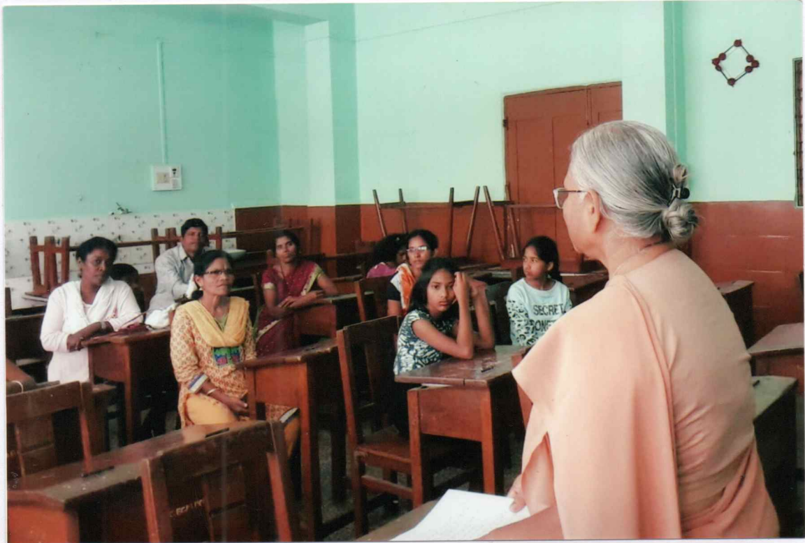
BOARDING MISTRESS INSTRUCTING PARENT'S ABOUT THEIR CHILDREN