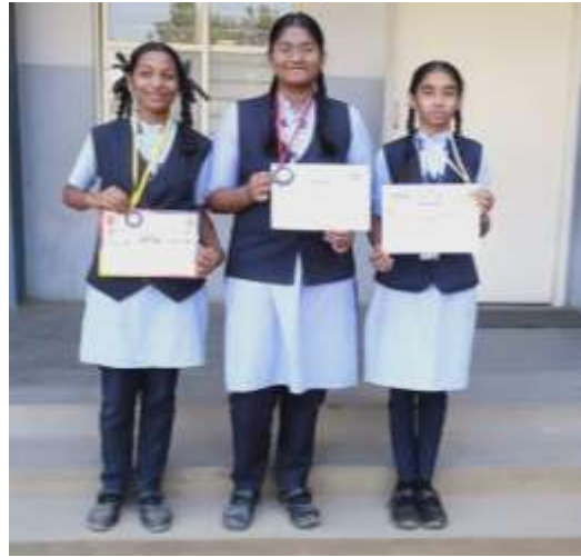
Taluk level represent high school