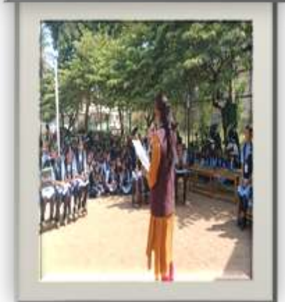
8 th Students