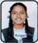
Angel A 517 (82.72%)