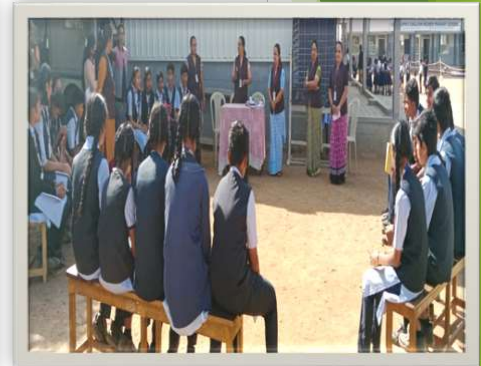
10 th Students