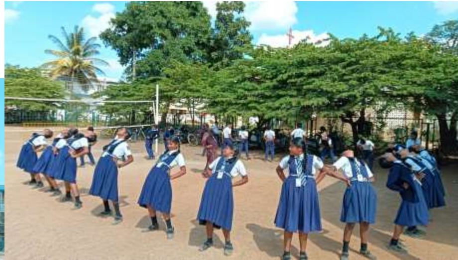
Warm up exercises